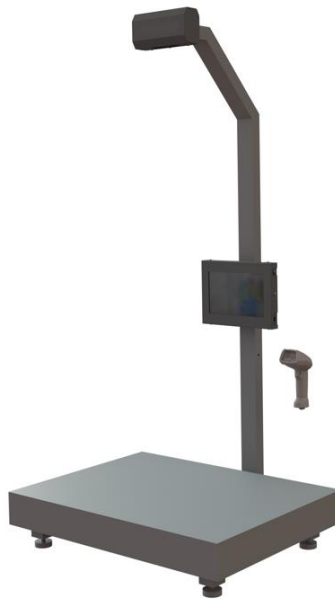
Figure 1. A general view of the system

A general view of the system is shown in Figure 1.